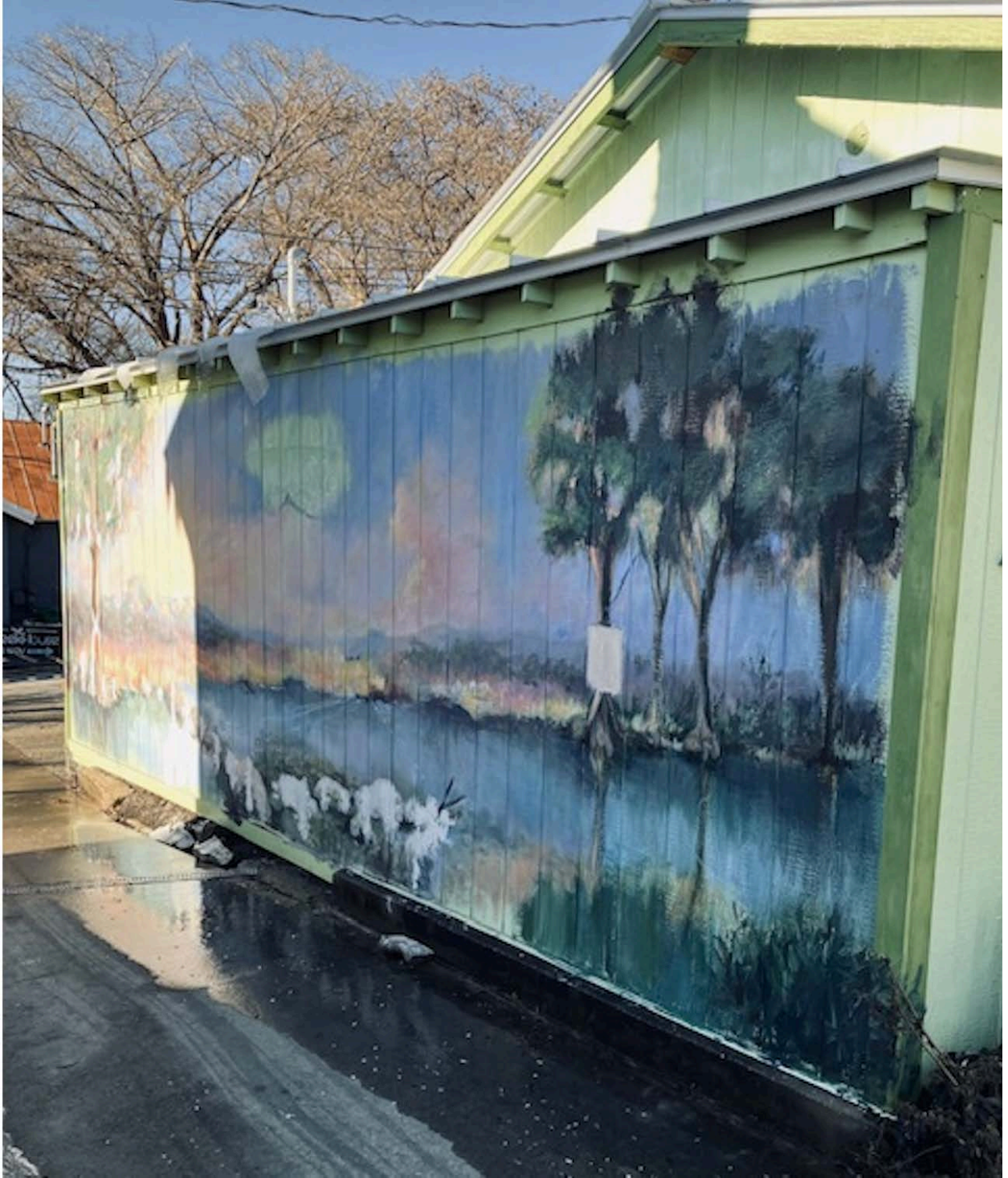
In The Garden -