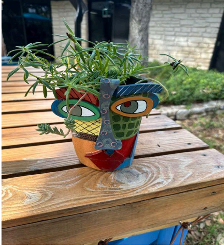
A flower pot designed by a local artist.

Outside each window is a new bird feeder that is filled by a volunteer 2 times a week. KWB donated 11 water tanks to collect rainwater to fill a newly renovated koi pond and for landscape watering. Local residents donated time and money to build accessible pathways, a potting bench, a pergola, gardens, and seating. Many local organizations and residents donated native plants and trees. Area artists donated sculptures, created hand-made bird houses, and painted the water tanks with beautiful designs and murals. (There are plaques near each element with donor information.)