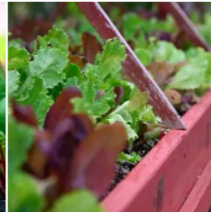
Greens (cool season)