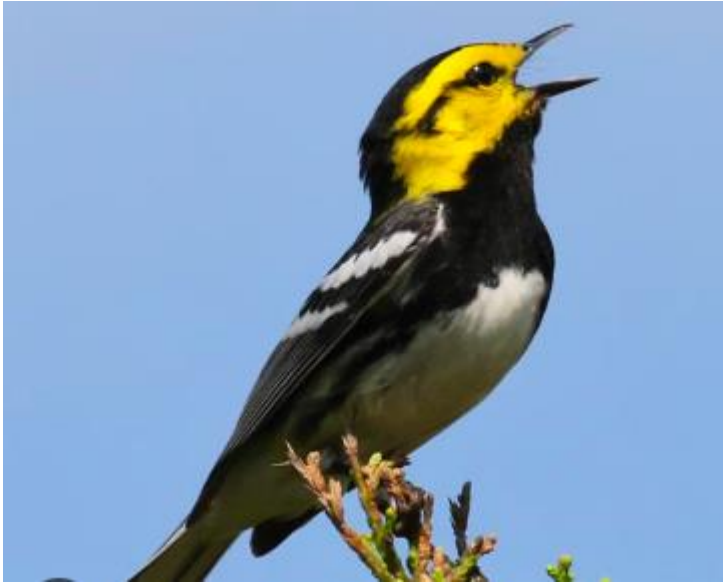
Our own Golden Cheeked Warbler

Bird City Texas communities demonstrate leadership by excelling in three key areas: community engagement, habitat enhancement and protection, and creating safer spaces for birds. Through these efforts, cities enhance and restore habitats, increase native plant coverage, reduce population-level threats, and promote public awareness about the benefits of bird conservation.